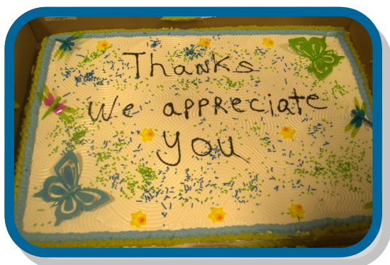
The beautifully decorated cake

Even though this was a one night event, we would like our volunteers to know that they are always valued.