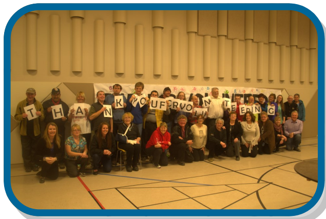
Individuals, athletes, and coaches pose together for a group photo