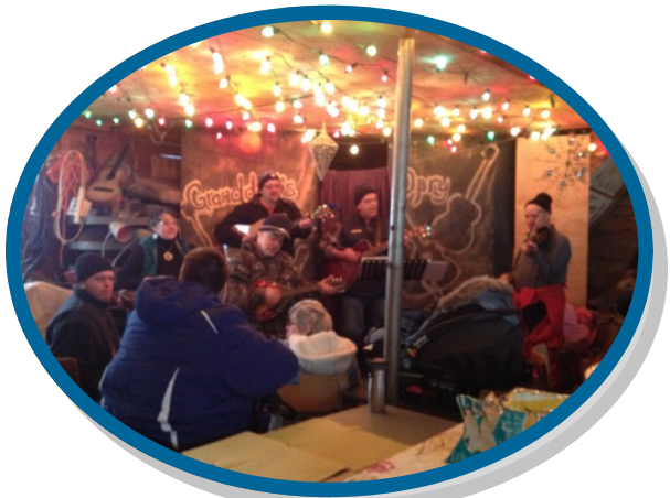
The gang enjoying some fun, live entertainment!