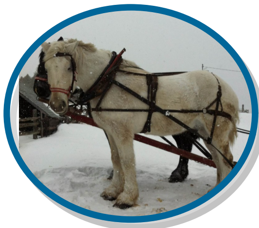
One of the beautiful horses at the Dewar Farm.